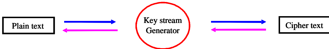
Figure 1. The file used by stream cipher to encrypt it.

According to the Table 2, we will show encode and decode status by random number. Any users just set initial value. In other hand, he can selects any random function. In this section, the random function is use by Visual Basic. The concept of diagram is shown in Figure 1.